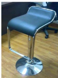
Barstool Code: BF-02 420(W)X400(D)X820(H)