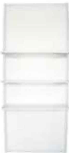
Shelf flat/ sloping Code: DS-01 1000(L)X300(W)