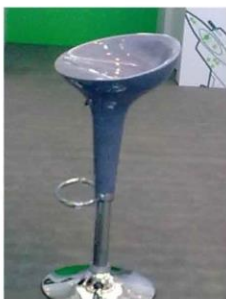
Barstool Code: BF-01 440(W)X480(D)X820(H)