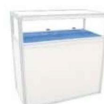
Small showcase Code: PX-02 1030(L)X535(W)X1030(H)