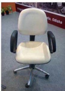
Executive Chair Code: CF-09 620(W)X500(D)X800(H)