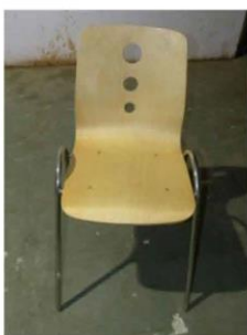
Wooden Chair Code: CF-03 440(W)X480(D)X820(H)