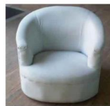
Vegas sofa single Code: LF-01 760(W)X440(D)X750(H)