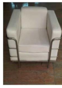
Sofa Chair with arm Code: SF-01 800(W)X750(D)X780(H)