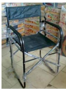
Folding Chair Code: CF-05 450(W)X460(D)X760(H)