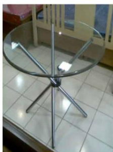
Round table Code: TR-01 850(D)X760(H)