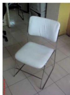
Standard Chair Code: CF-07 460(W) X 460(D)