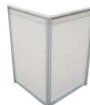
Display cube Code: PX-06 535(L)X535(W)X760(H)