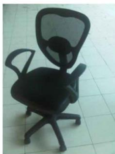
Office Chair Code: CF-10 650(W)X550(D)X800(H)