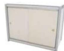
Lockable cupboard Code: PX-03 1030(L)X535(W)X760(H)