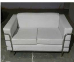
Sofa Chair with arm double Code: SF-02 1700(W)X750(D)X780(H)