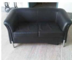
Vegas sofa double Code: LF-02 1290(W)X440(D)X800(H)