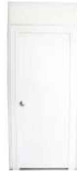
Lockable door Code: AS-03 1000(L)X2440(H)