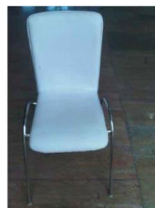
Leather Chair Code: CF-08 450(W)X450(D)X800(H)