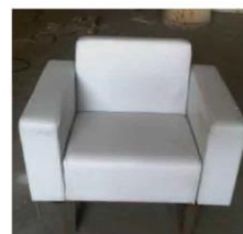
Sofa Code: LF-03 800(W)X750(D)X750(H)