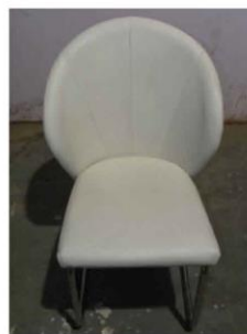
Barcelona Chair Code: CF-11 600(W)X550(D)X760(H)